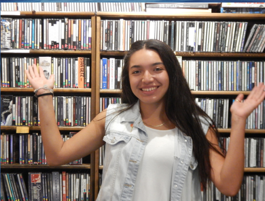
Capital Campaign KSQD